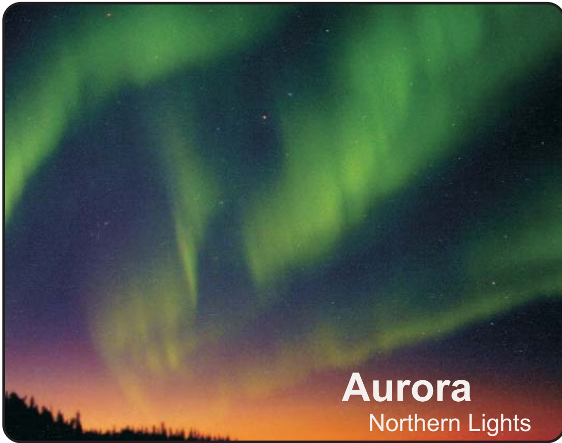
Aurora Northern Lights