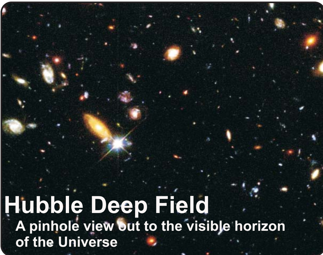
Hubble Deep Field

A pinhole view out to the visible horizon of the Universe